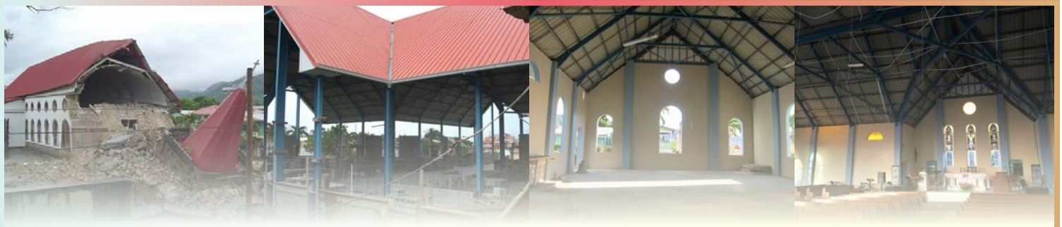
Caption: St. John St. Lewis' original church destroyed by 2004 earthquake through its reconstruction