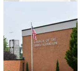
CHURCH OF THE TRANSFIGURATION (TR)