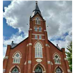
ST. MARY CATHOLIC CHURCH (SM)