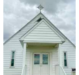
ST. TERESA OF THE INFANT JESUS (ST)