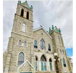
ST. PATRICK CATHOLIC CHURCH (SP)