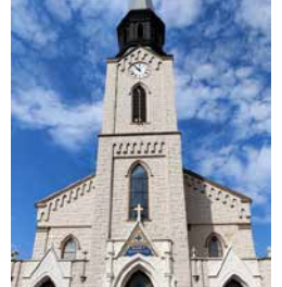
ST. BONIFACE CATHOLIC CHURCH (SB)